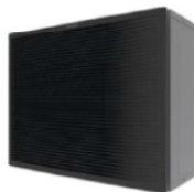
Daikin Altherma 3 H HT EPRA014-018DV ★ Daikin Altherma high temperature split