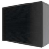
Daikin Altherma 3 H HT EPRA014-018DV ★ Daikin Altherma high temperature split